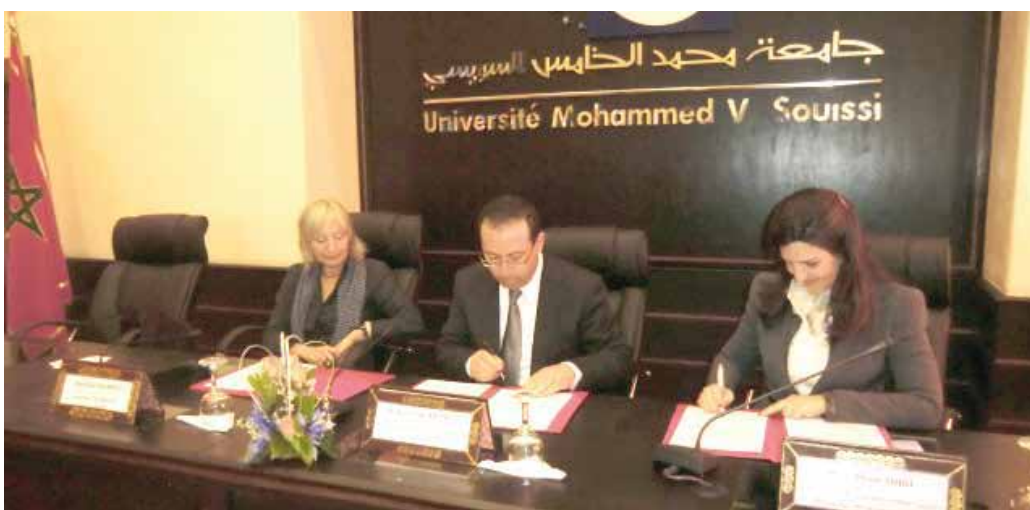
Signature with University Med V Souissi, GIZ, MWM, on Feb 15th 2012