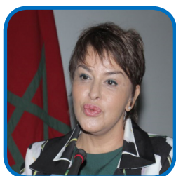
Hakima El Haite, Minister in Charge of Invironment