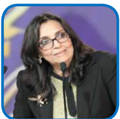
Najima THAY THAY RHOZALI Former Minister of Literacy and Non-Formal Education