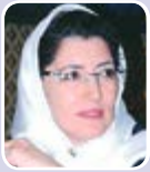
President 2015 - Today

Newsletter Mentoring N°17 – January - June 2016